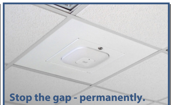
Eliminate gaps in the ceiling tile by mounting WAPS in Oberon enclosure

Healthcare environments must anticipate rapid growth in wireless and wired infra-structure. Oberon enclosures simplify wireless and structured cabling growth, moves, adds, & changes in healthcare facilities.